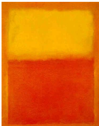
Mark Rothko, Orange and Yellow , 1956, Albright-Knox Art Gallery, Buffalo, New York.

Rothko did not arrive at full abstraction until 1949. The paintings from this period usually consist of one or two rectangular sections of various colors and sizes that are "frayed or softened at the edges." 121 The soft nature of these rectangles often causes observers to view the shapes as floating or even pulsating. These rectangles, however, exist for functional rather than aesthetic reasons. In 1967, Abstract Expressionist Robert Motherwell wrote, "I remember some years ago talking to Rothko about automatism. When he developed the style in the late 1940s for which he is now famous, he told me that there are always automatic drawings under those larger forms." 122 The rectangles in these mature paintings are, essentially, disguises meant to veil Rothko's surreal figures. Rothko was so satisfied with this compositional format that he used it to create hundreds of paintings until his death in 1970. 123