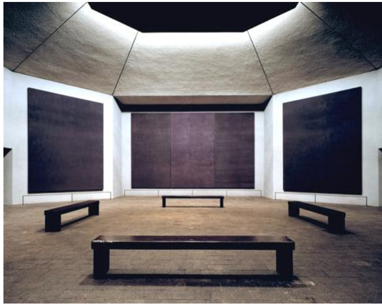
Interior view of the Rothko Chapel in Houston.

experience. If meditated upon, these colored spaces have the potential to bring a viewer's unconscious thoughts to a conscious level.