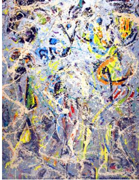
Jackson Pollock, Galaxy , 1947, Joslyn Art Museum.