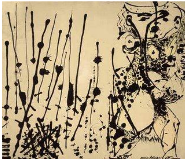
Jackson Pollock, Number 7, 1951 , 1951, National Gallery of Art, Washington D.C.

1951 (1951, National Gallery of Art, Washington D.C.), created completely in black, displays a series of long poured lines interspersed with blotches of paint. A dense square of interwoven drips is situated under this series of blotchy lines. The right side of the painting shows the greatest departure from Pollock's all-over drip paintings. The figure of a woman can be easily discerned amongst a cluster of curvilinear lines and splotches. The woman has a face with two eyes, a nose, and a mouth. Her breasts and torso are prominent in the painting. This sudden return to the depiction of the female form can be explained in Jungian terms. It is likely that with the return of his alcoholism and mental problems, Pollock's mother complex, as described by Doctor Henderson, returned in full force. Thus, the repressed terror that Pollock harbored in regard to his mother, Stella, was unleashed once again in his art.