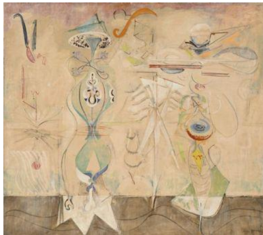
Mark Rothko, Slow Swirl by the Edge of the Sea , 1944, Museum of Modern Art, New York.

Thus, Rothko attempted to depict the inner self in his portraits, rather than a specific likeness. He felt that by abandoning the human figure, he could create a more realistic image of a person's true being. 83 Slow Swirl by the Edge of the Sea (Museum of Modern Art, New York), one of Rothko's paintings from 1944, is a double portrait, presumably of Rothko and his second wife, Mell. 84 This portrait represents a change from Rothko's portraits of the 1930s, before he was influenced by Surrealism, which contain recognizable human figures. In Slow Swirl , the humans are depicted as a series of odd shapes, curved lines, and spirals. Though unidentifiable, these figures are drawn from Rothko's instincts; they represent how his psyche truly identifies itself with his wife.