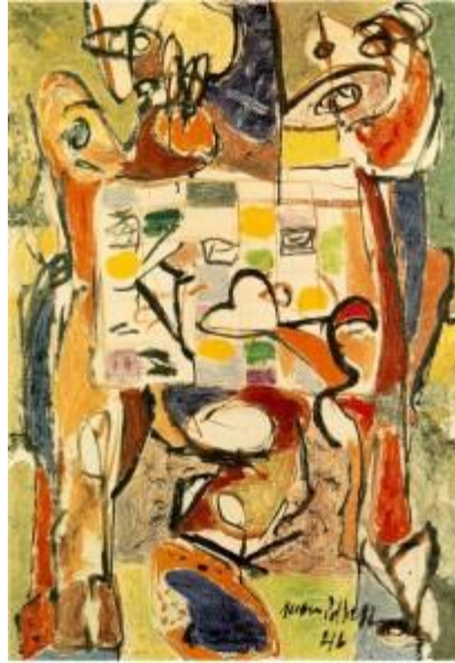
Jackson Pollock, The Tea Cup , 1946, Collection Frieder Burda, Baden-Baden.

While Pollock's new found use of bright color was short-lived, the effects of his new lifestyle continued to transform his work. This transformation is clearly seen in Galaxy (Joslyn Art Museum), one of Pollock's paintings from 1947. This painting is included among Pollock's first set of drip paintings; however, it contains some remnants of the style employed in the "Accobonac Creek Series" beneath the splatters, presumably added later. 92 Amorphous, brightly-colored shapes are veiled by a series of drips, mostly white. In the same year, Pollock created Reflection of the Big Dipper (Stedelijk Museum, Amsterdam) and Full Fathom Five (The Museum of Modern Art, New York), both of which were entirely covered with the drips that appeared in Galaxy . Specific shapes reminiscent of those used in the "Accobonac Creek Series" or in his earlier works, however, are not present on the surface of these two drip paintings.