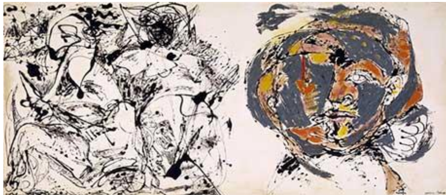
Jackson Pollock, Portrait and Dream , 1953, Dallas Museum of Art.

word “portrait” is obvious, the dream displays Pollock’s knowledge of Jung. Archetypes are, according to Jung, produced by the collective unconscious. The collective unconscious, however, is usually only reached through dreams or art. Though Pollock, arguably, gained contact with the collective unconscious through his art, he displays a recognition of the ability to connect with the collective unconscious through dreams, as seen through the use of the word “dream” in the title.